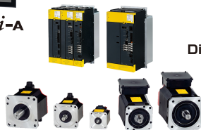
αi-D series SERVO

ROBOMACHINE - Meets the latest needs of the market