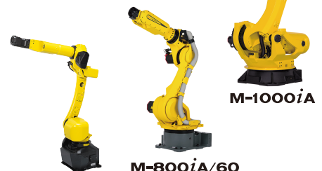
M-10iD/10L M-800iA/60 M-1000iA

IoT - Interprets and clarifies data in manufacturing sites to lead the way for Kaizen