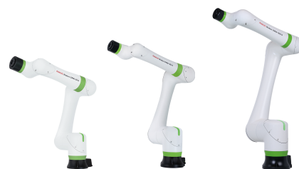
CRX-5iA CRX-10iA CRX-25iA