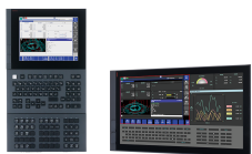
FANUC Series 500i-A

Easy-to-Use FANUC Collaborative Robots - Even for First Time Users