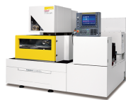
ROBOCUT α-CiC series