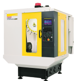
ROBODRILL α-DiB Plus series

ROBOMACHINE - Meets the latest needs of the market