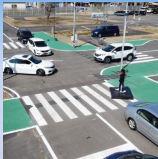
Honda Cooperative Intelligence

Making mobility in the skies more accessible for people