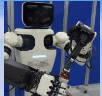
Honda Avatar robot

Always there for people and to help people